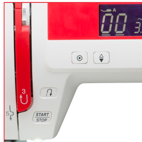
Easy Convenience Buttons